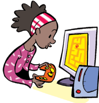
1 play computer ...