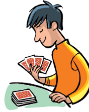
3 play ...