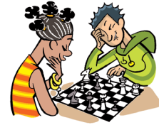
4 play ...