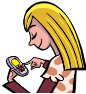
9 send ... messages