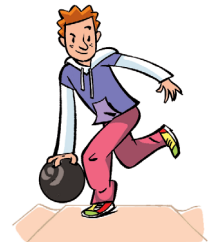
6 go ...