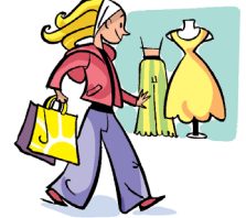
5 go ...