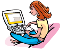
10 ... the Internet