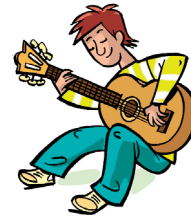
7 play the ...