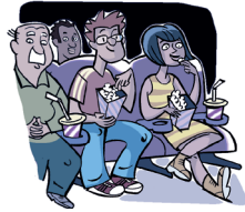
2 go to the ...