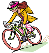
8 ride a ...